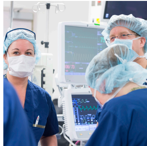
Aligned Hospital Strategic Goals: Better Patient Experience, Better Staff Experience, Better Value