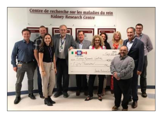
KRC staff and members of La Serata Italiana Committee.

Save the date for the 2020 gala: Saturday, March 7, 2020.